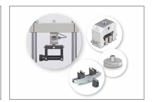
Solid and flexible fixing options for many clamps and accessories from the SAUTER product range, see Accessories