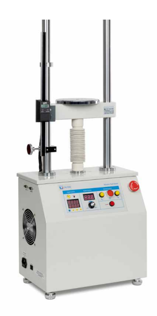
Motorised test stand incl. length measuring device LB